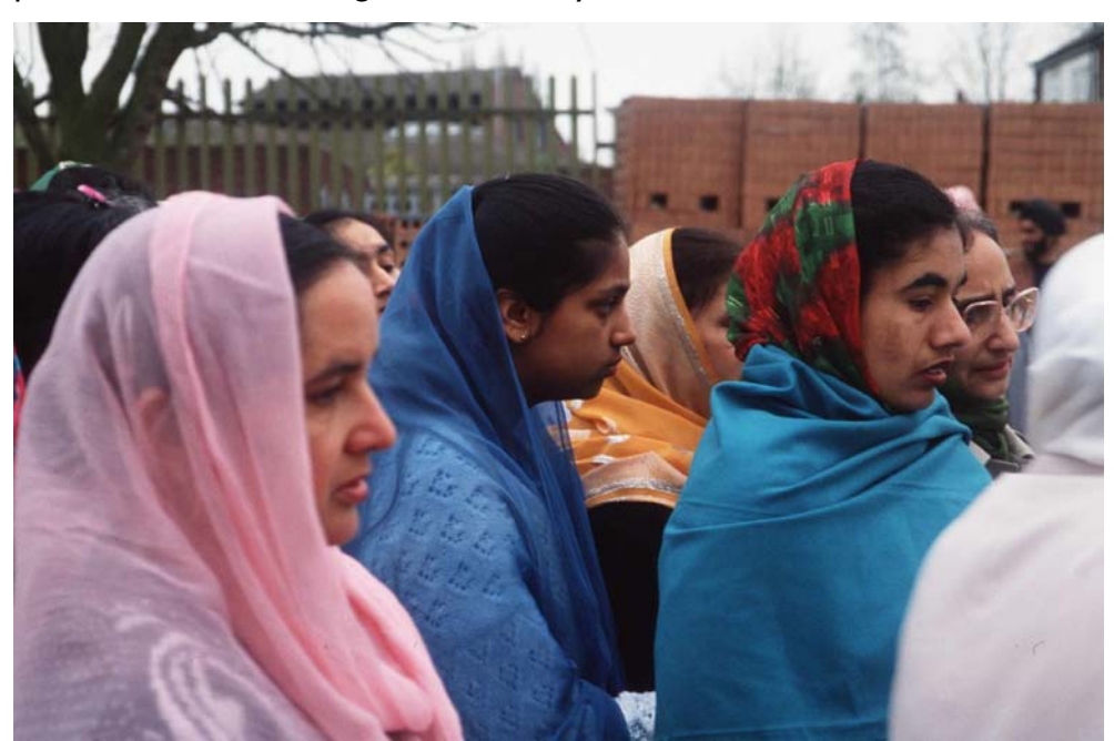
Sikh women standing outside a gurdwara

Sikh students are unlikely to seek segregation of the sexes in classroom or field trip activities. Sikhs often proudly point to gender equality in their community. It is certainly true that the Gurus' teaching honours women and that women can publicly read the scriptures just as men can. But, as in many other communities, many girls grow up knowing that their behaviour—especially mixing with the opposite sex—is more closely supervised than that of their brothers. Similarly there may be a greater expectation that they will learn domestic skills. In some cases this greater family pressure can stimulate a correspondingly greater need to test their personal freedom during their student years.