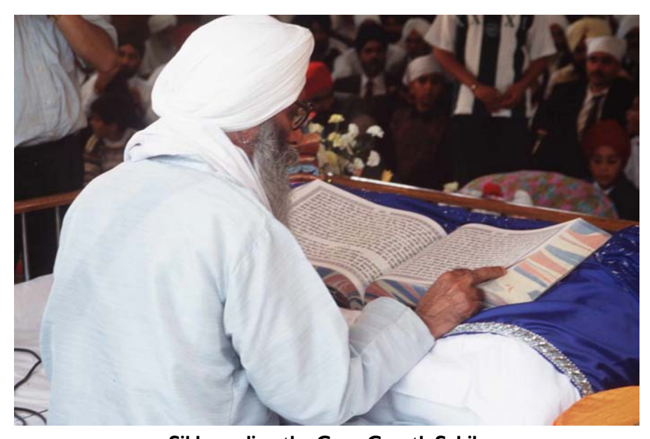
Sikh reading the Guru Granth Sahib

In common with others from South Asian backgrounds, Sikh students are likely to have strong bonds with relatives, whom outsiders may not regard as 'next of kin', within their extended families. The implications of this include the fact that the relative's illness or death may affect the student deeply. Also, the student may request several days leave if, for example, there is a reading of the scriptures following the death.