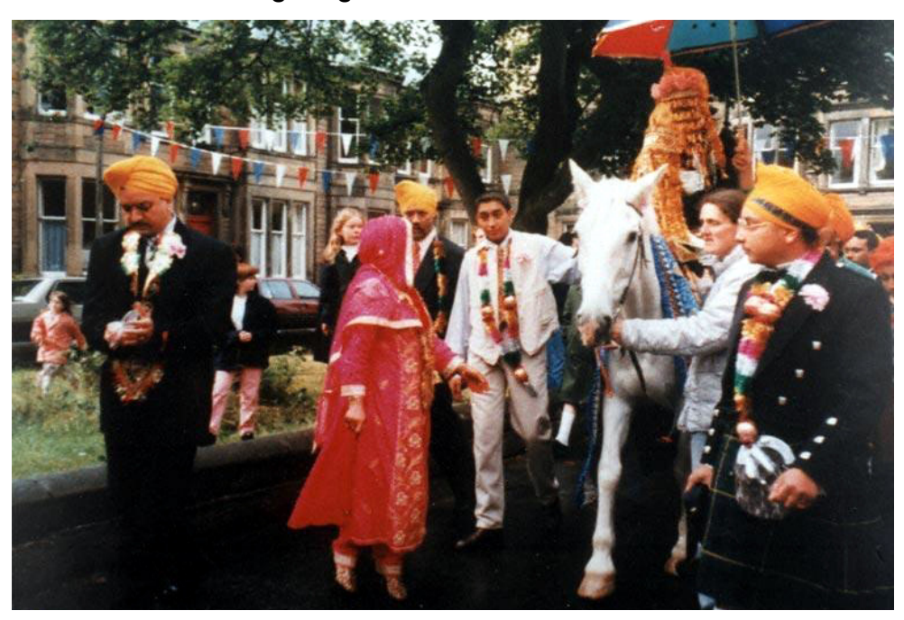
A Sikh wedding procession; traditionally—and sometimes in the UK—the bridegroom arrives on a white mare.

Family honour continues to be a guiding concern in Punjabi families. (See section on Being Punjabi). In Punjabi the word for this is izzat (or ijjat). The opposite is of course shame and disgrace. Over the centuries families have felt the greatest dishonour when the reputation of their daughters is at stake. For this reason Sikh women may be acutely anxious about gossip about their behaviour getting back to their families.