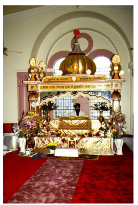
The Gurdwara in Edinburgh

Some gurdwaras are headed by a spiritual leader, known as a Sant or Baba. Their followers use the affectionate and respectful term 'Babaji' rather than using the Sant's name. Some Sants belong to a succession. The prominence of Sants and Babas is controversial among Sikhs.