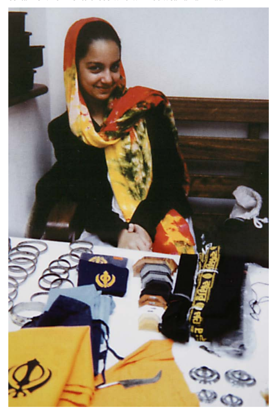
Selling Sikh symbols—mainly kara and khanda badges—in a gurdwara

Sikhs as a community have confidence in their track record of hard work and adaptability. Some will have concerns about possible discrimination, especially in relation to the turban. Since the 1970s a succession of legal rulings has allowed Sikhs to wear the turban in lieu of other regulation headwear. However, for example in engineering, they may fear that employers will be reluctant (eg for insurance-related reasons) to employ in certain environments those who will not wear a hard hat.